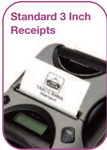
Standard 3 Inch Receipts