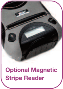
Optional Magnetic Stripe Reader