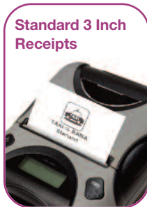
Standard 3 Inch Receipts