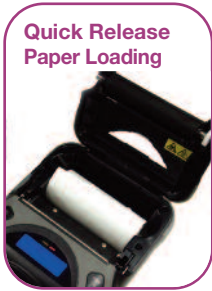
Quick Release Paper Loading