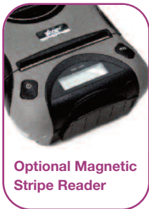
Optional Magnetic Stripe Reader