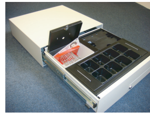
3. Notes skim into note box