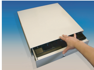
2. Close drawer